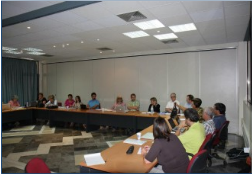
Working Group 1